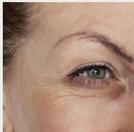
Fine lines / wrinkles

Early signs of photodamage includes: 8,9