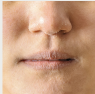
Rough, dry skin