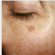
Dark spots or hyperpigmentation