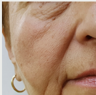
Loss of skin elasticity

Women of all ages are concerned about fine lines, wrinkles, and rough, dry skin *10